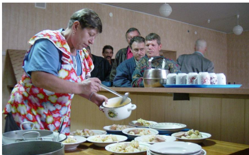
Distribution of meals for the poor & homeless people