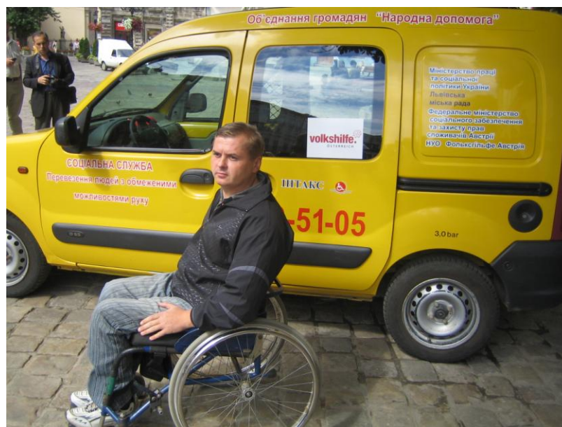
Mobile service of transportation of people with disabilities "Social Taxi"