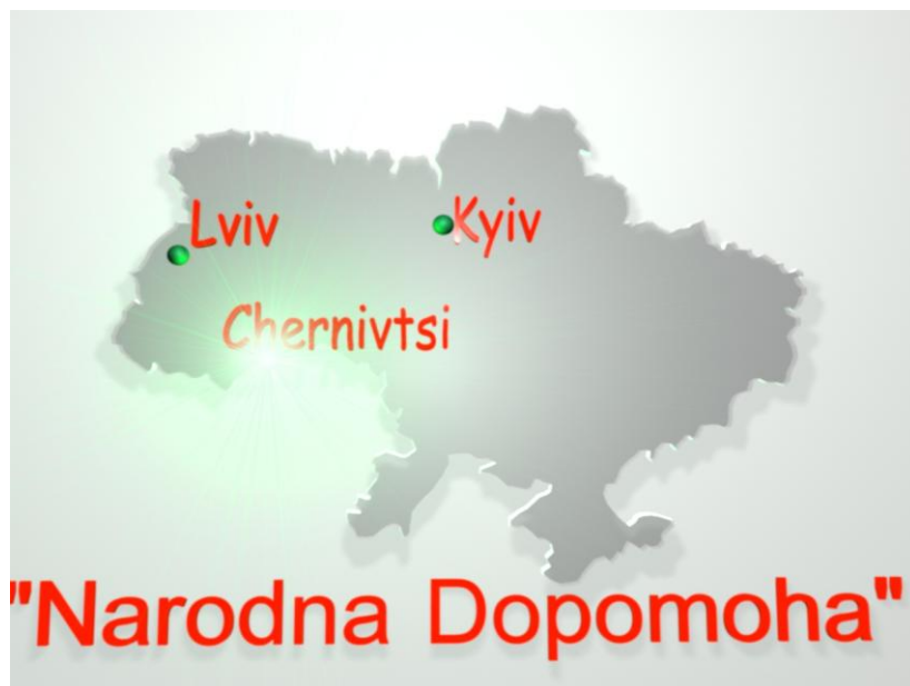
Narodna Dopomoha in 3 cities of Ukraine – Chernivtsi, Kyiv and Lviv on a map of Ukraine