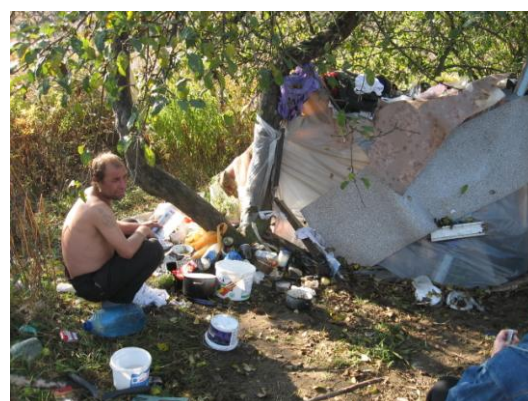
Places of homeless people "settlements" visited by street social workers