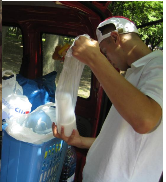
Giving away used clothes & hygiene items for those in need during street work