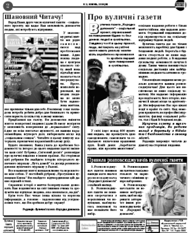
Street Paper is distributed in Kyiv by homeless and socially-excluded people from September 2008