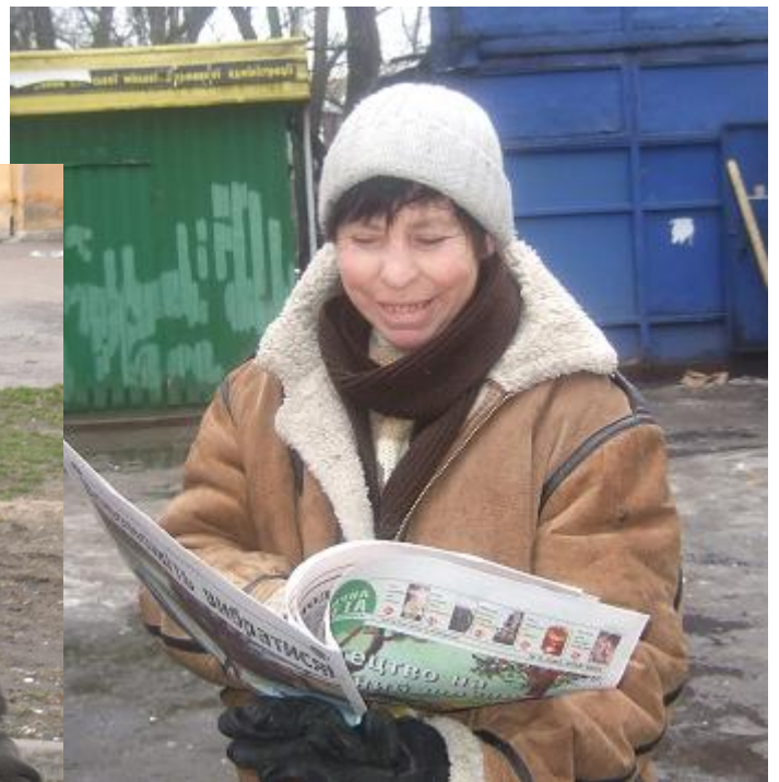
Homeless person who tries to earn her living by selling street paper