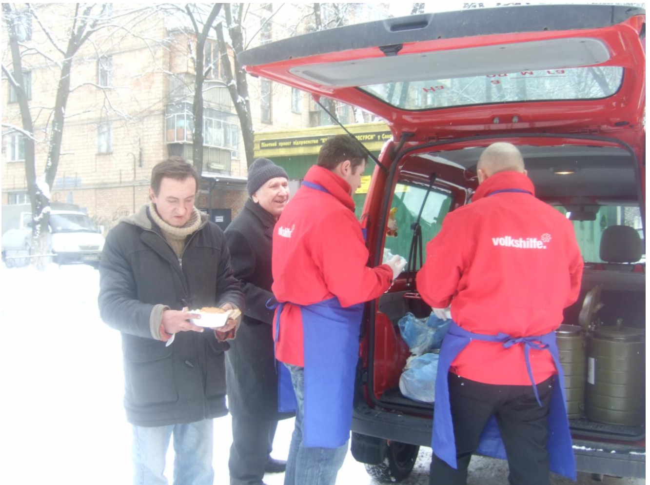
Meals-on-Wheels: distributing hot meals for homeless people